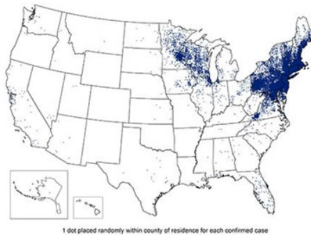
US Reported Cases of Lyme Disease 2015