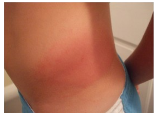
Typical homogenous erythema migrans rash that usually is >5 cm and grows quickly in size. Antibiotics result in quick reversal and fading of the rash.

disease will depend both on healthcare provider and patient education as well as knowing how to properly interpret testing, unless new methods for diagnoses of B. burgdorferi in development appear superior.